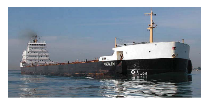
The Canadian M/V PINEGLEN, closed the St. Lawrence Seaway 2007 Navigation Season.

The Canadian M/V PINEGLEN loaded with 15,692.5 tons of pig iron (refined ore) bound for Marinette, Wisconsin, cleared the U.S. Seaway locks on December 28. This ship officially closed the Montreal-Lake Ontario section of the St. Lawrence Seaway ending the binational waterway's 48th navigation season at 283 days.