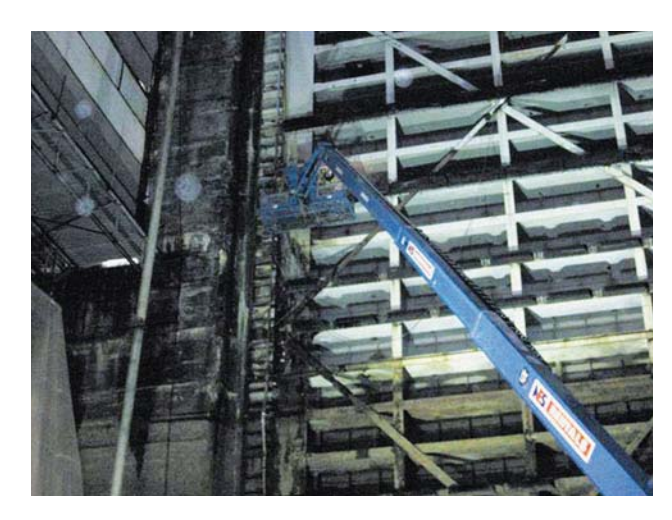
Crews being lifted to replace damaged rubber fenders on the downstream miter gate.

heat and energy. Work has commenced for replacing damaged rubber fenders on the downstream miter gate at Snell Lock. This work is being done from a personnel lift as can be seen in the second photo. Crews have begun removing a filling valve at Snell Lock for reinforcing and painting and inspections of the culvert valve operating machinery open gearing at both locks are almost complete. All projects are on schedule for completion in early to mid-March.