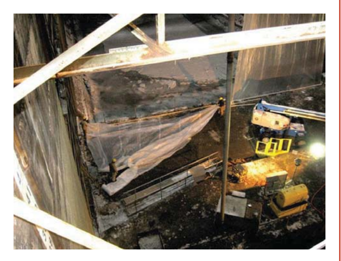
Crews hang plastic curtains to isolate the work area.

Maintenance crews have already dewatered, inspected and made repairs to lock structures and machinery at Eisenhower Lock which are inaccessible during the navigation season. Repairs were made to cracks in the downstream miter gate, and shims were installed on the upstream miter gate to compensate for wear on the miter contact blocks. Snell Lock has been covered and dewatered and heaters have been installed and the work areas set up. In the first photo, you can see crews hanging plastic curtains to isolate a work area to conserve