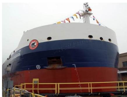
The Algoma Niagara was the opening ship marking the start of the St. Lawrence Seaway's 60th navigation season. March 29, 2018. Lock 3, Welland Canal, St. Catharines, Ontario.