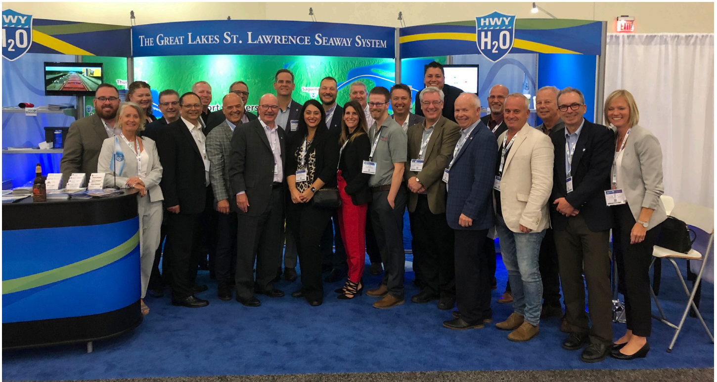
Great Lakes Delegation at the 2019 Breakbulk Americas Exhibition and Conference in Houston, Texas.

The Saint Lawrence Seaway Development Corporation and The St. Lawrence Seaway Management Corporation co-led a binational delegation of Great Lakes Seaway System stakeholders to the 30th annual Breakbulk Americas Transportation Conference & Exhibition in Houston, Texas, from October 8–10, 2019. Conference organizers announced that 5,000 attendees and 350 exhibitors from around the world gathered in Houston for the three-day event and were represented by terminal operators, logistics providers, carriers and representatives involved in the movement of general and breakbulk cargoes including steel, machinery and project cargo, lumber, and paper.