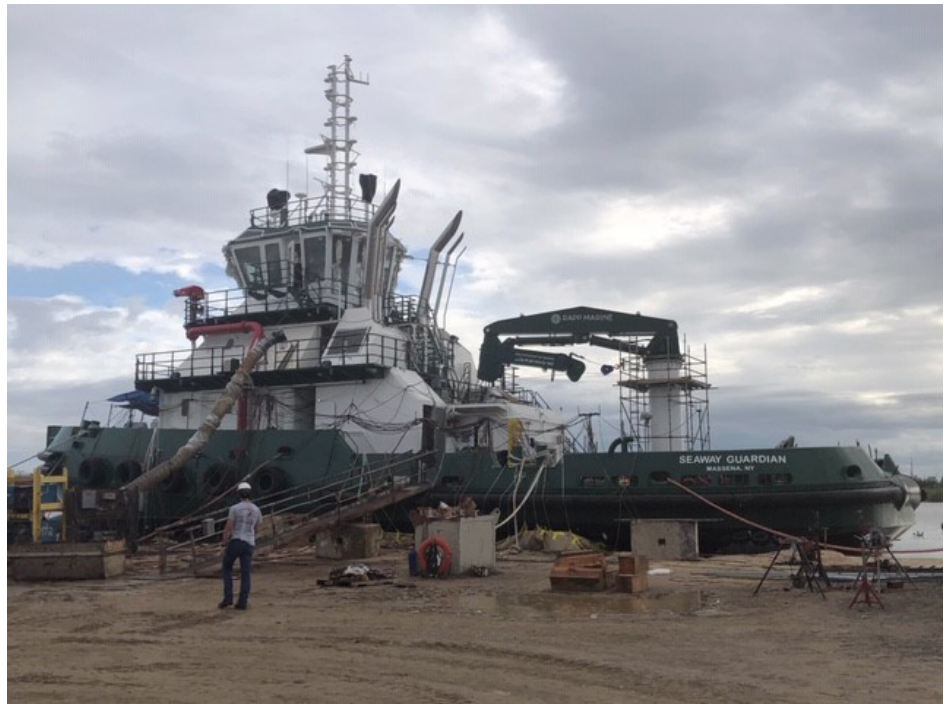
Seaway Guardian at the dock with crane installed