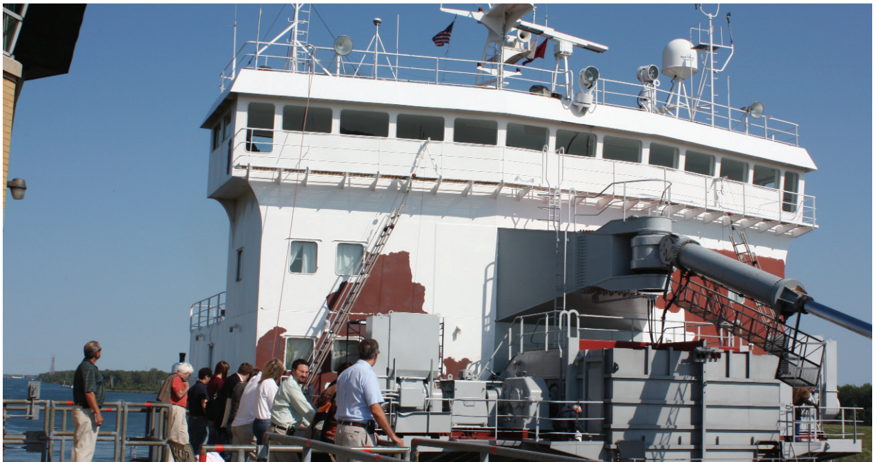
Congressional delegation watches a ship go through the locks.

The briefings included a discussion led by the SLSDC's Chief Engineer of the infrastructure projects being funded in FY09 under the Asset Renewal Program. The group visited one of the rehabilitation projects, the Seaway International Bridge, as part of the day's tour. In addition, Seaway Corporation managers provided attendees a personalized briefing of lock operations and vessel traffic control procedures. A demonstration of our navigational system, the Automatic Identification System, took place aboard the Seaway's workboat, the Robinson Bay , on which the group had the opportunity to transit Eisenhower lock. A discussion of the joint ballast water inspection process and a viewing of a ship transiting through the locks capped off the day.